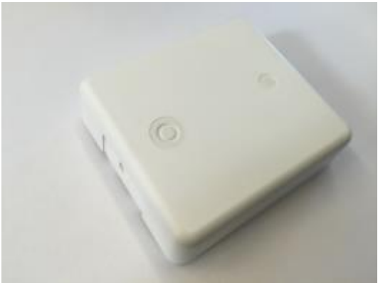
Figure 3: Top housing installed