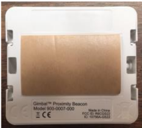
Figure 1: Bottom housing with double-sided tape applied