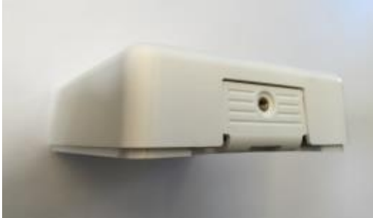
Figure 4: Properly closed Beacon is NOT flush

DO NOT apply excessive pressure while closing the Beacon or after it has been installed as doing so can damage the Beacon